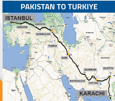
KARACHI TO ISTANBUL THROUGH IRAN

Distance: 1106 Km Approx Travel Time: 4-6 Days