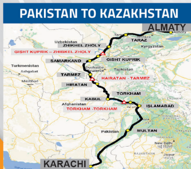
KARACHI TO ALMATY THROUGH AFGHANISTAN

Distance: 5300 Km Approx Travel Time: 10-12 Days