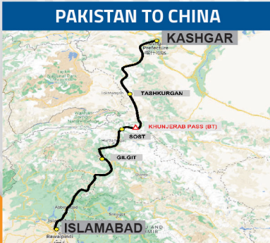
ISLAMABAD TO KASHGAR

Distance: 1106 Km Approx Travel Time: 4-6 Days